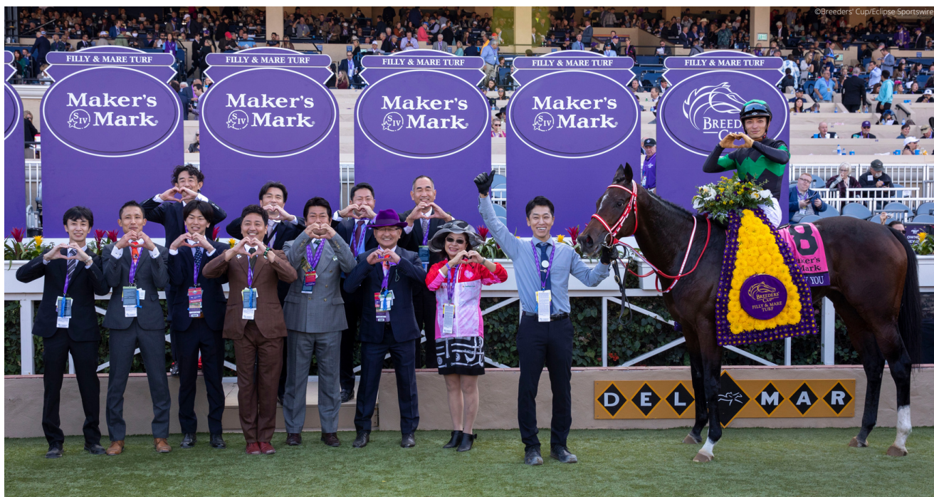
Loves Only You became the first Japanese-trained winner at the Breeders' Cup and was joined by Marche Lorraine several races later