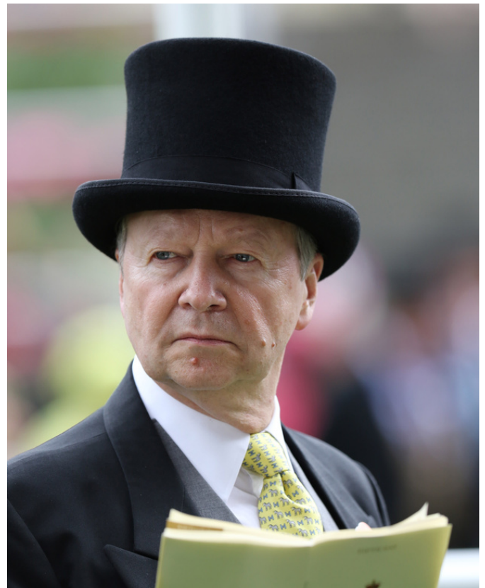
Engelbrecht-Bresges is passionate about improving international racing